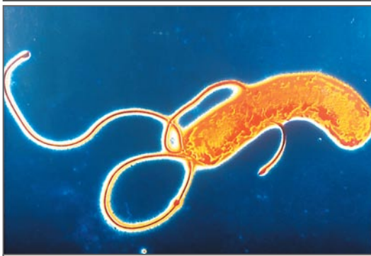
Figure 1. Helicobacter pylori .

H. pylori is a gram-negative bacterium with a helical rod shape. It has prominent flagellae, facilitating its penetration of the thick mucous layer in the stomach.